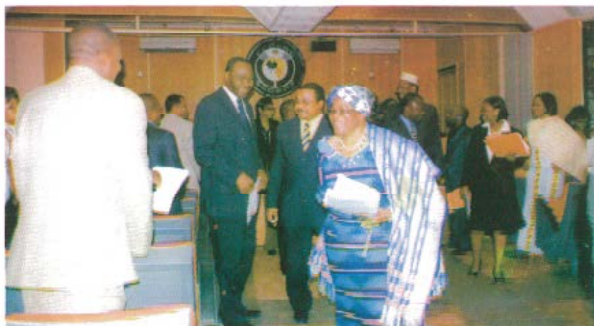
Closing ceremony of training programme on law organised for secretaries and administrative assistants

Among the ECOWAS Institutions, the Court stands out as a unique institution, with its own rules of operation, like the national courts whose rules of operation are different from the other public administrative institutions.