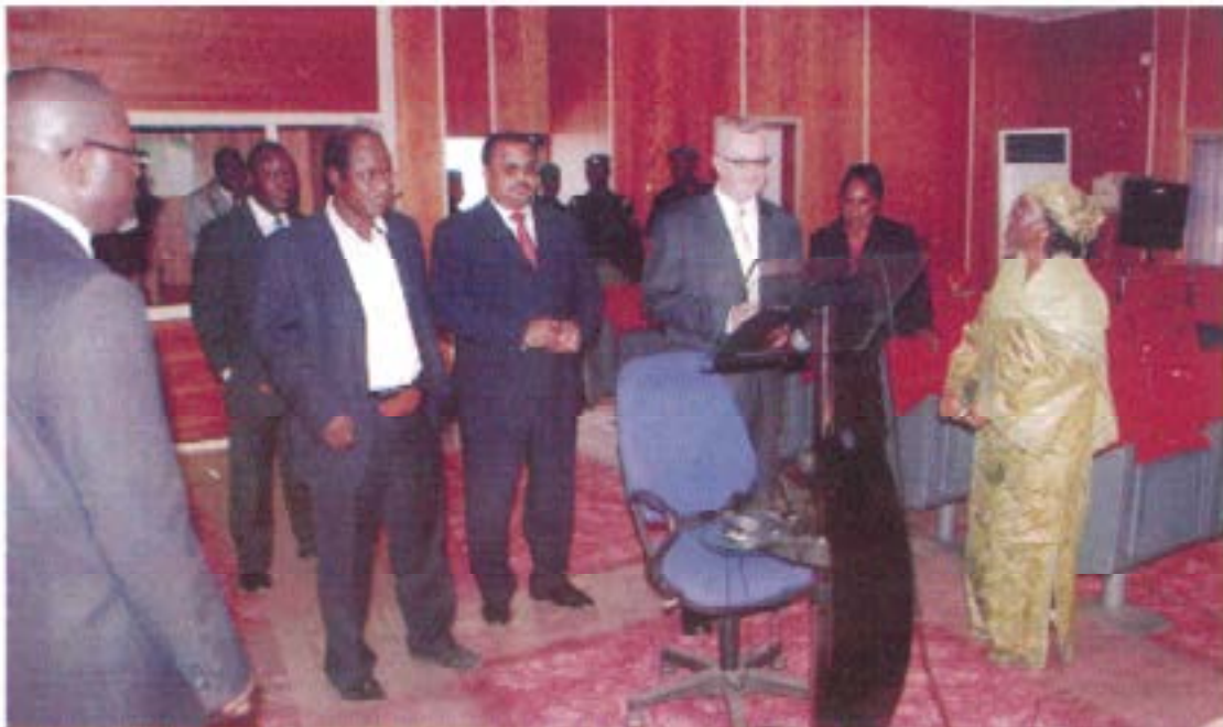
Visit to the Court by the Belgian Ambassador to Nigeria

At the European Court of Justice, the judges attended a court hearing on a case dealing with the free movement of capital, whereas at the European Court of Human Rights, they followed the