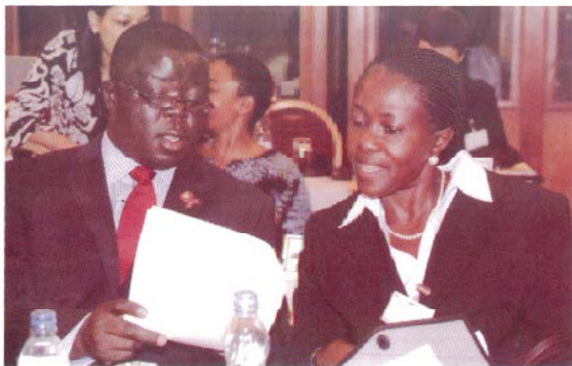
Participants in the seminar on human rights protection held at Addis Ababa from 30 November to 2 December 2009

The conference also recognized the imperative of convening workshops of the kind been held on a regular basis to facilitate sharing of information and concrete proposals on ways and means of fast-tracking human rights issues and the identification of strategies geared towards overcoming obstacles to human rights promotion and protection at all levels.