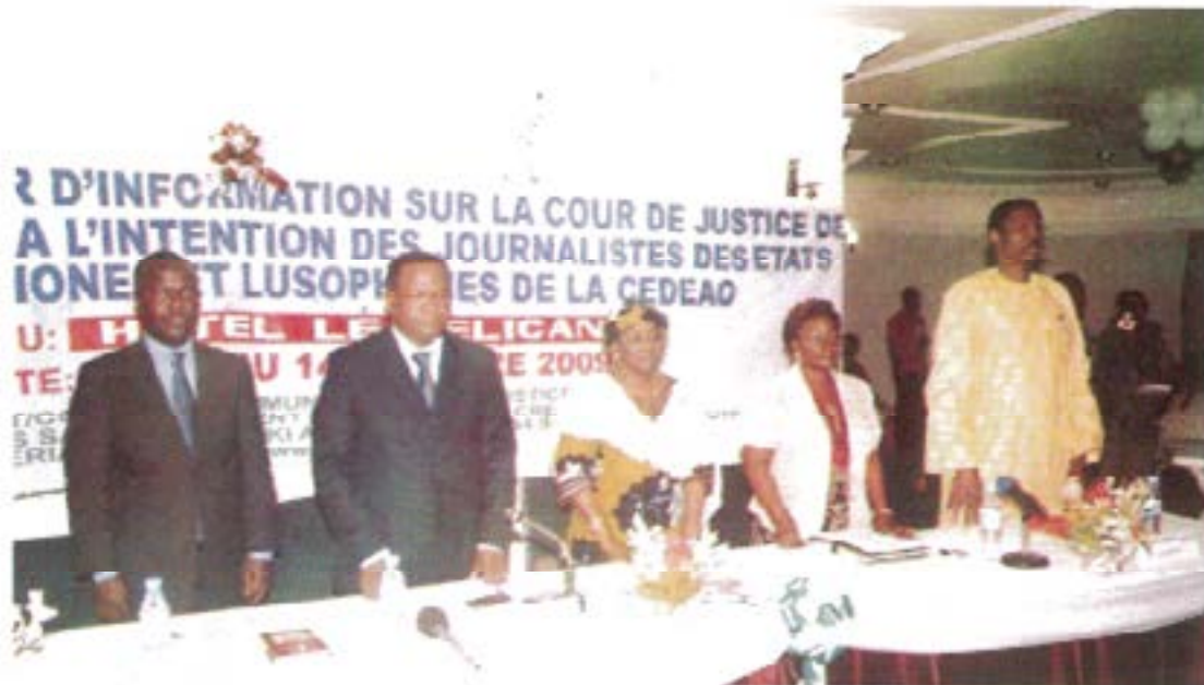
Opening ceremony of seminar held at Lome for French-speaking and Portuguese-speaking journalists of West Africa

Court also initiated radio and television programmes in Benin, Ghana and Liberia, thus making it possible to reach people in the remotest parts of towns and villages in those Member States and the neighbouring ones.