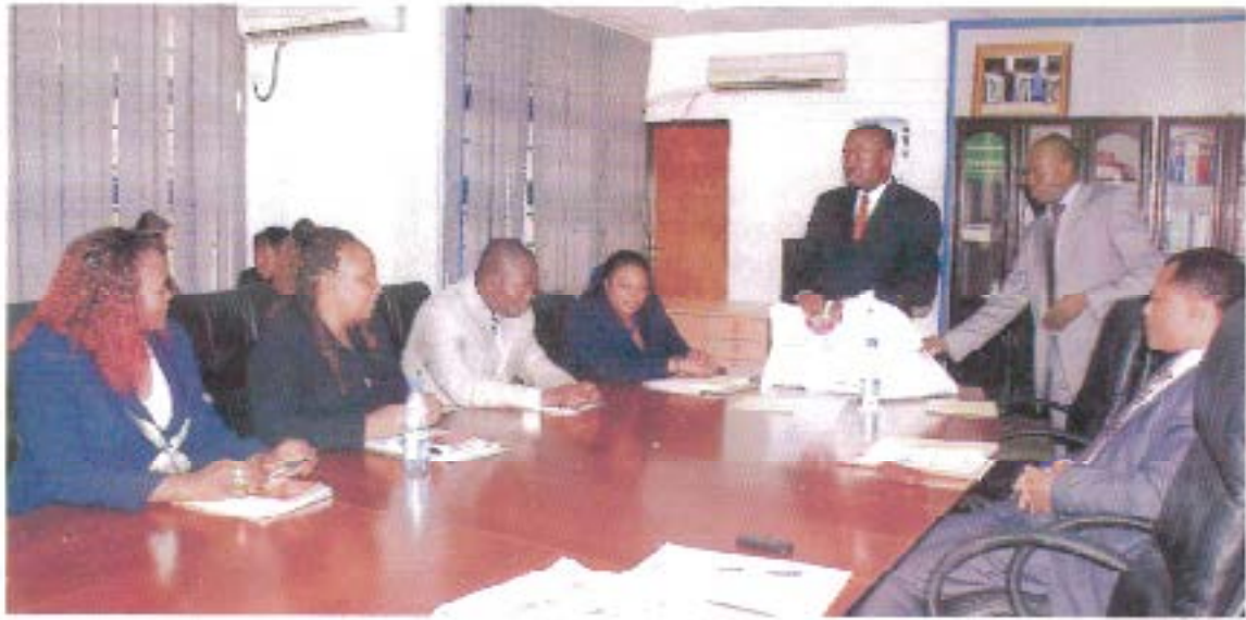
A delegation of the Court of Justice of SADC in a working session at the Court of Justice of ECOWAS

on the roles and functions of their respective Departments. A complete set of documentation was presented to them.