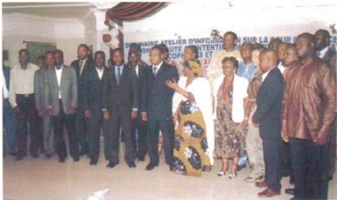
Group photograph of participants at seminar held of Lomé for French-speaking and Portuguese-speaking journalists of West Africa

At the dawn of the tenth anniversary of the Court, when the occasion calls for a stock taking of the activities of the Court, it is not surprising to notice that a lot remains to be done in the area of information and communication because many are the people who still remain ignorant of the existence of the Court. Given the prevailing state of affairs, a review of the existing strategies is on-going and it is imperative to improve upon the relations between ECOWAS Institutions and the media, and reduce the increasing dearth of communication between the legal