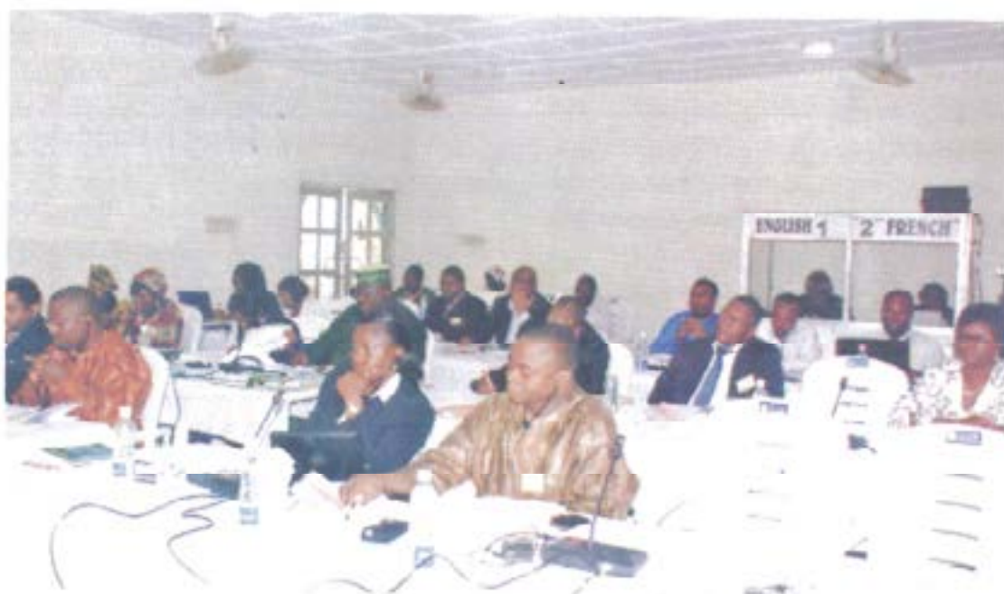
Lawyers and legal professionals among the staff of the Court, at a judicial retreat at Minna (Niger State)

harmonise all the documents relating to the procedure before the Court. Indeed, since the coming into being of the two Supplementary Protocols on the Court (that of January 2005 and that of June 2006), the amendments they effected on the original protocol (the 1991 Protocol) and the contradictions they generated in certain provisions of the Rules of the Court (adopted in 2002) have remained unchanged, thus creating confusion in the minds of parties and their counsels when reading the texts. These texts therefore need to be rectified. After a lengthy debate on the issue, it was finally recommended that discussions will be pursued further on the significant amendments to be made on the